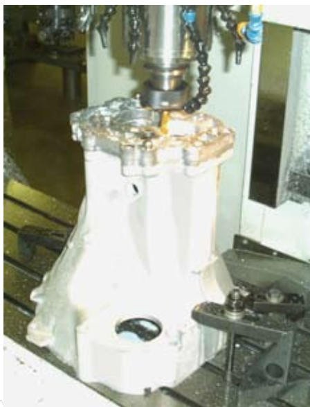
Utilizing the latest cad/cam equipment

With Barrington Performance's Dog Ring transmission you come out of the corner using that power range that your engine builder spent so much time and money getting you!